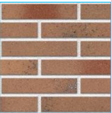
PGH - CORIUM 73315 327 x 65mm OR SIMILAR

Copyright URBAN LINK PTY LTD © Notes: 1. CONTRACTOR MUST VERIFY ALL DIMENSIONS ON SITE BEFORE COMMENCING WORK OR PREPARING SHOP DRAWINGS. 2. DO NOT SCALE DRAWINGS. 3. CONTRACTOR TO CHECK UNDERGROUND SERVICES BEFORE COMMENCING WORKS BY CONTACTING DIAL BEFORE YOU DIG. IF DIAL BEFORE YOU DIG INFORMATION IS PROVIDED WITH THIS DOCUMENTATION IT SHALL BE ASSUMED NOT TO BE CURRENT AND CONTRACTOR SHALL MAKE THEIR OWN ENQUIRES. DIAL BEFORE YOU DIG Call 13 20 20