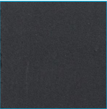
GROOVED PRECAST PANEL FINISHED IN NAWKAW GABBRA E1 OR SIMILAR